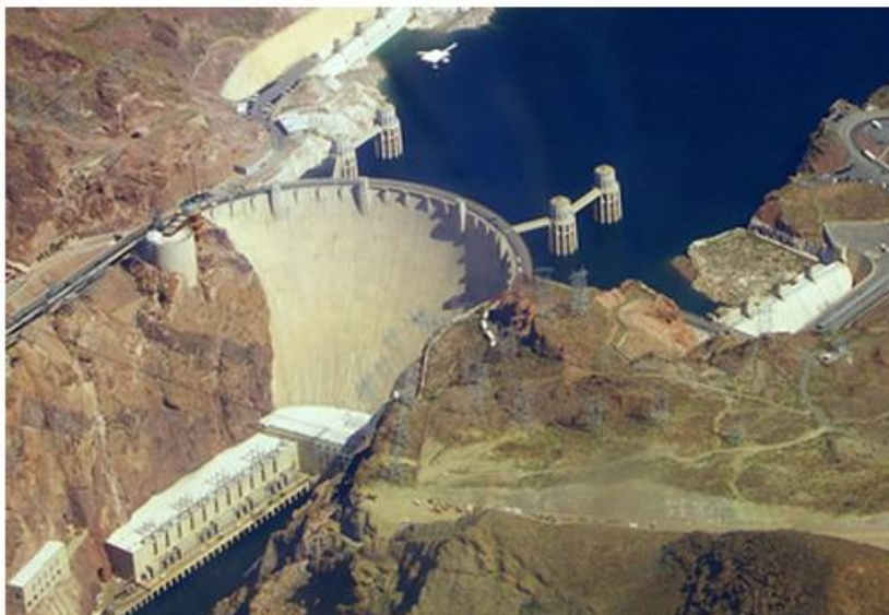
Boulder Dam (re-named Hoover Dam) – 1935: Now producing an average of 4.2TWh per year since 1940 and it sees more than a million tourists annually.