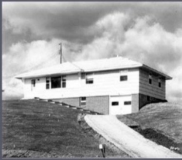
Bloomington, MN 1956.

your parents "can afford" is that government is actually under-writing most of the risks associated with the transaction so it will be "affordable" to your parents - White purchasers only, in this case. (That is in part the origin of the American Middle-Class and much of the wealth they've owned and "created" since WW II)!