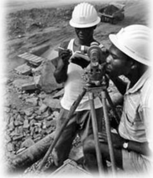
Two Ghanaian surveyors take a reading at the dam site, 1963