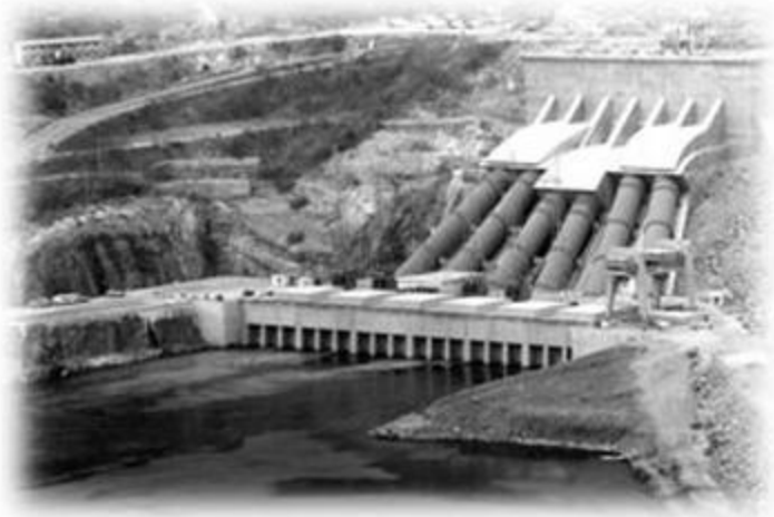
The Volta River Dam at Akosombo, Ghana, 1968